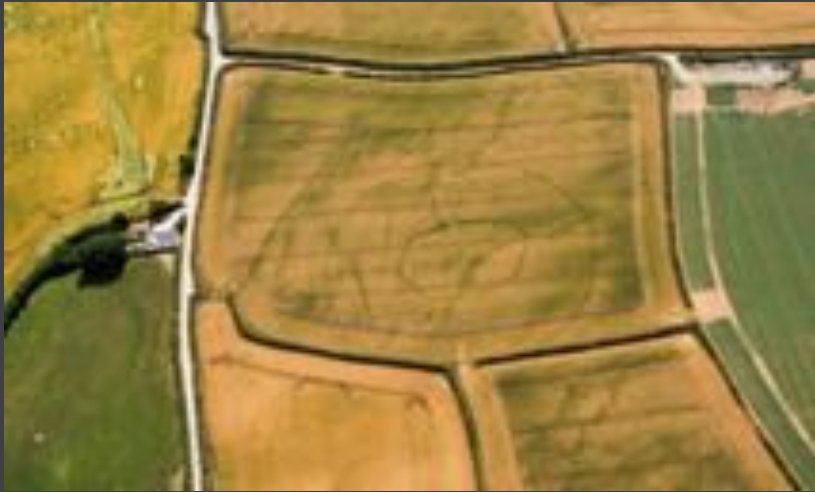
Prehistoric settlements near Eynsham, Oxfordshire and Lansallos, Cornwall.