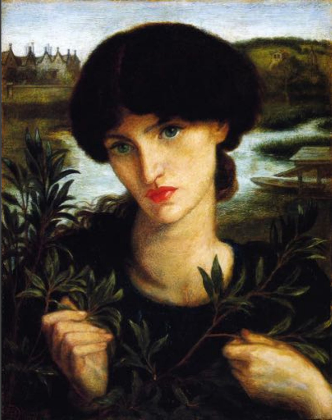
Dante Gabriel Rossetti Water Willow , 1871 Delaware Art Museum