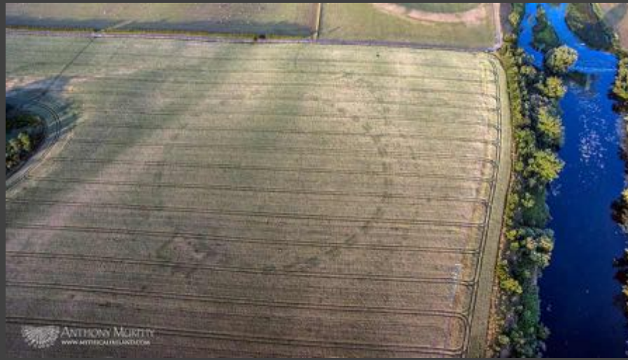
A new prehistoric henge discovered at Brú na Bóinne, Ireland.