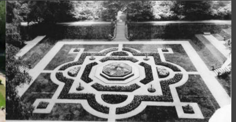
Victorian garden at Gawthorpe Hall, Lancashire.